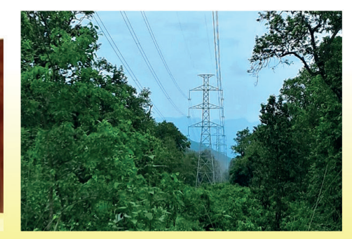
BHARATPUR-BARDAGHAT TRANSMISSION AFTER 13 YEARS