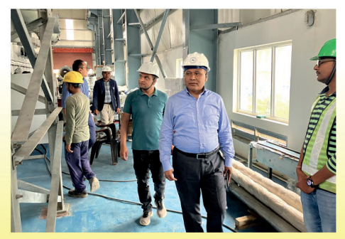
KULA MAN'S TWO YEARS A LONG MARCH