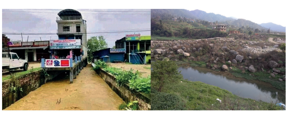
Classic example of urban encroachment into a river's realm...

but over-used handled or improperly are finding their way into food chains and water bodies. They have led (in pockvegetable growing areas) to cancer among even young children and girls